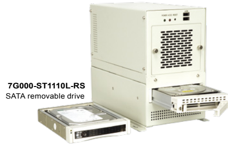
3.5" SATA removable drive bay compatible